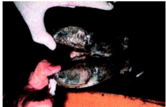
Figure 1. Foot rot in a cow showing separation of the interdigital skin, revealing a whitish-yellow necrotic core-like material.

Feet infected with F. necrophorum serve as the source of infection for other cattle by contaminating the environment. Disagreement exists on the length of time F. necrophorum can survive off of the animal, but estimates range from one to ten months. Once loss of skin integrity occurs, bacteria gain entrance into subcutaneous tissues and begin rapid multiplication and production of toxins that stimulate further contin-